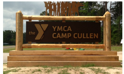
Main entrance sign

Please do not hesitate to contact us if you have any other questions.